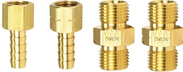
152-Series 154-Series 156-Series 158-Series