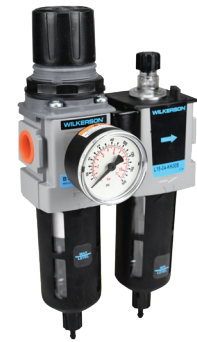
with transparent bowl and guard

NOTE: SCFM ratings at 150 PSIG inlet pressure.