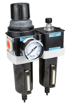
with metal bowl

FRLs are designed for air service only, unless otherwise indicated.