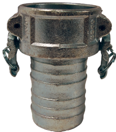
plated malleable iron