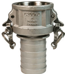
316 stainless steel